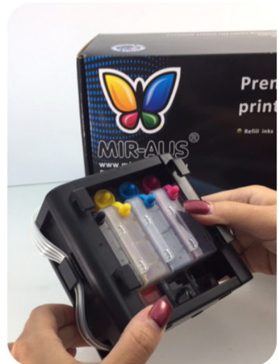
3. Gently roll the tank unit onto one side