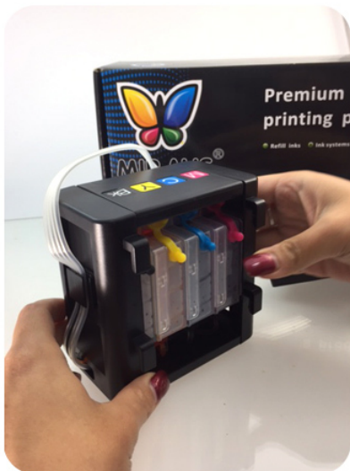
3. Put the tanks back in upright position