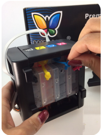
4. Remove all the coloured small plugs from the tank unit (leaving the larger plugs in place/closed).