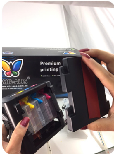
2. Remove the door