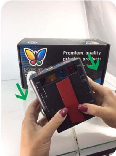
1. Push door towards down